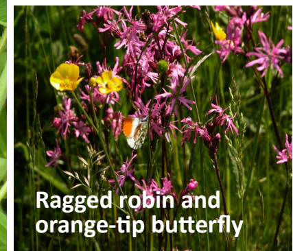
Ragged robin and orange-tip butterfly