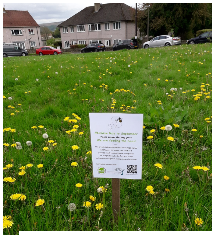
Spring 2022, Incommunities met residents, Gwyneth & Paul with AEG. They agree the fruit trees can stay and to leave the grass unmown through the summer.