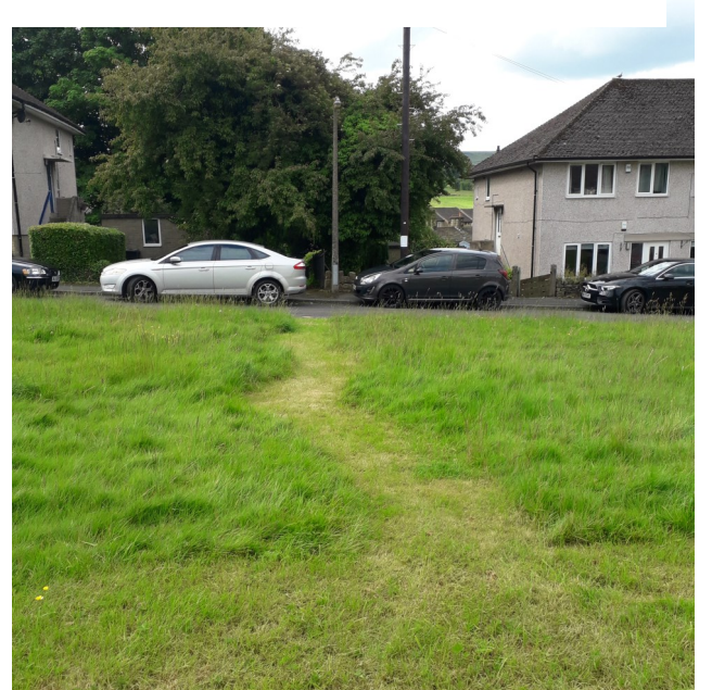
Incommunities mowing team cut a central area and grass paths in late May 2023

Local resident, Gwyneth, plants fruit trees in winter 2021 to start making the green more attractive.