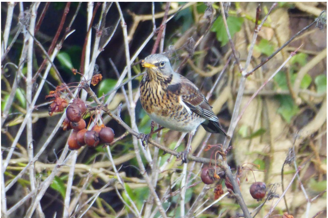
Fieldfare in Addingham garden (Austin)