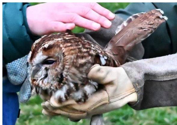
Photo of a Tawny owl being released by Gill Battarbee after being caught in the cricket nets

Goldcrest: 35 reports. Reported from 6 gardens around the village, the former First School site and on Transects: 1, 5, 7, and 8.